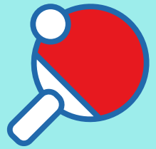
TABLE TENNIS RACKETS AND BALLS ON LOAN FROM RECEPTION